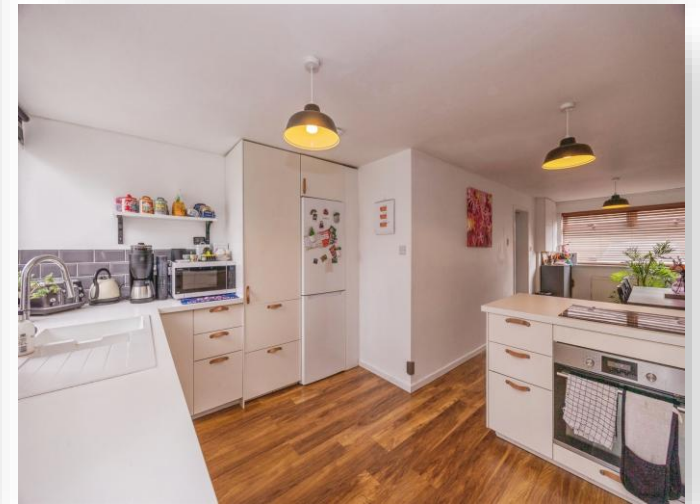
Chidham Square, Havant PO9 1DX