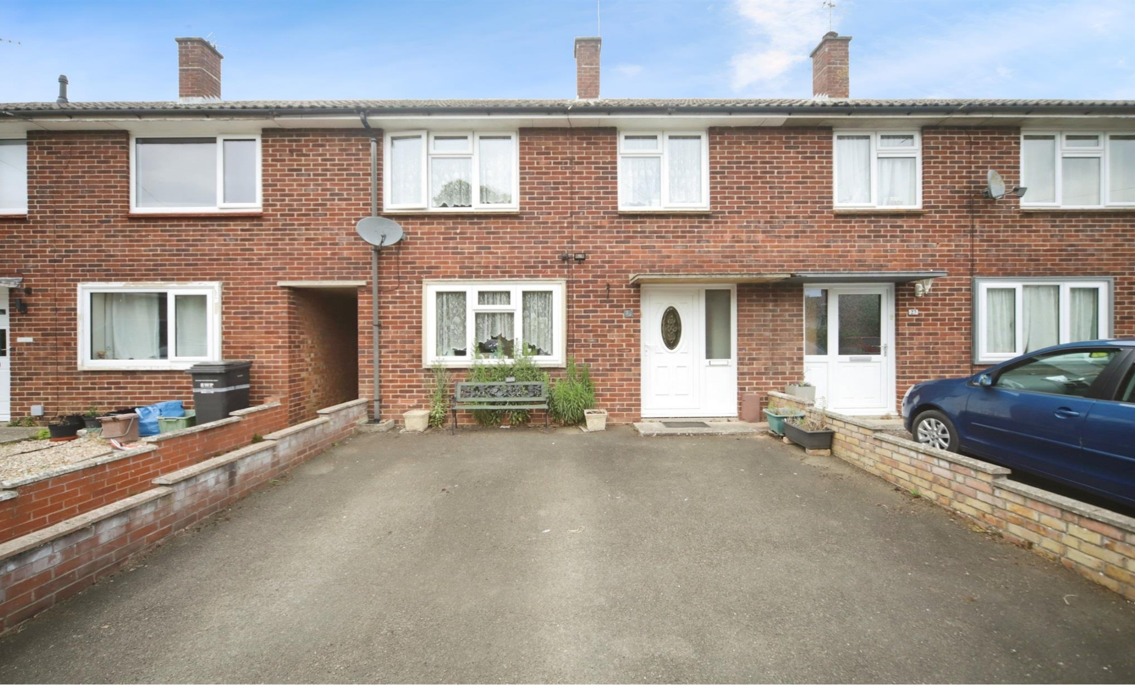
Pickeridge Close, TAUNTON TA2 7HN