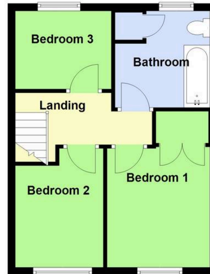
Total area: approx. 96.0 sq. metres (1032.8 sq. feet)