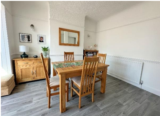
Family Room:- 14' 8" x 8' 5" (4.47m x 2.56m)

UPVC double glazed windows and doors overlooking and accessing the South facing rear garden, seating area, further radiator, a flat insulated ceiling with skylight, spotlights inset. Internal door to: