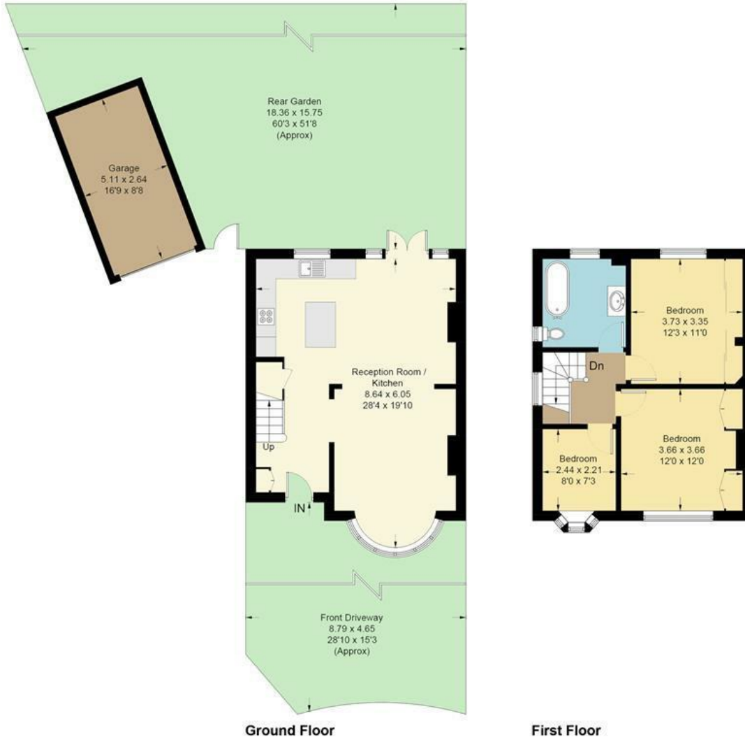
Illustration for identification purposes only, measurements are approximate, not to scale. Fourlabs.co © (ID1300560)