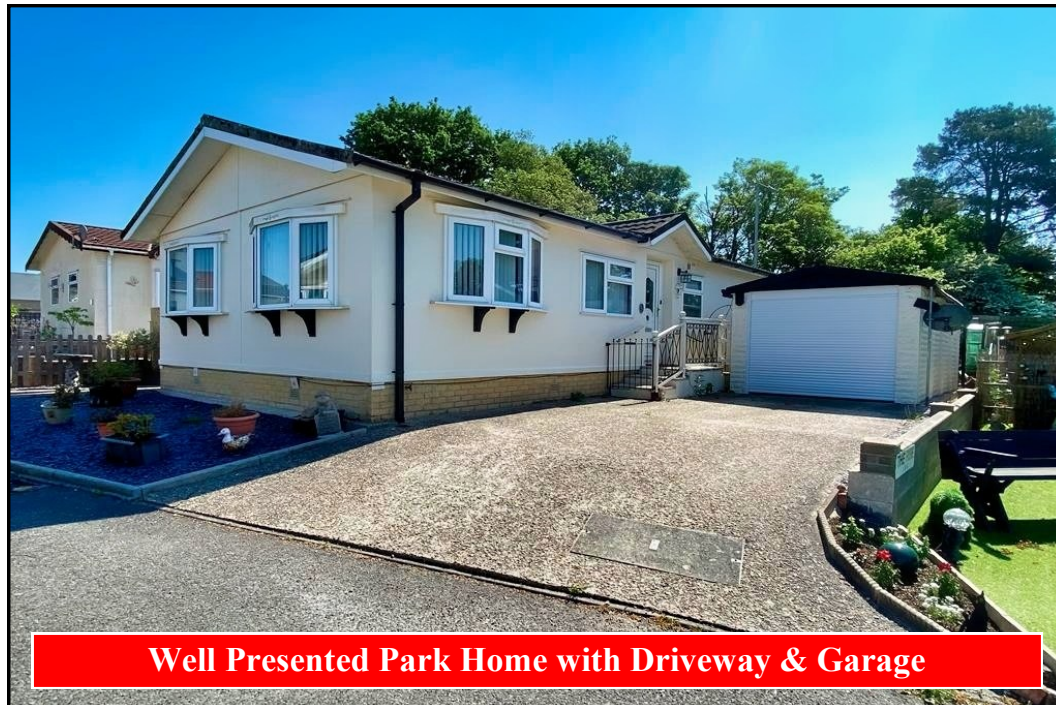
Well Presented Park Home with Driveway & Garage

6 The Rise, Oaklands Park, Crossways, Nr Dorchester, Dorset. DT2 8JQ