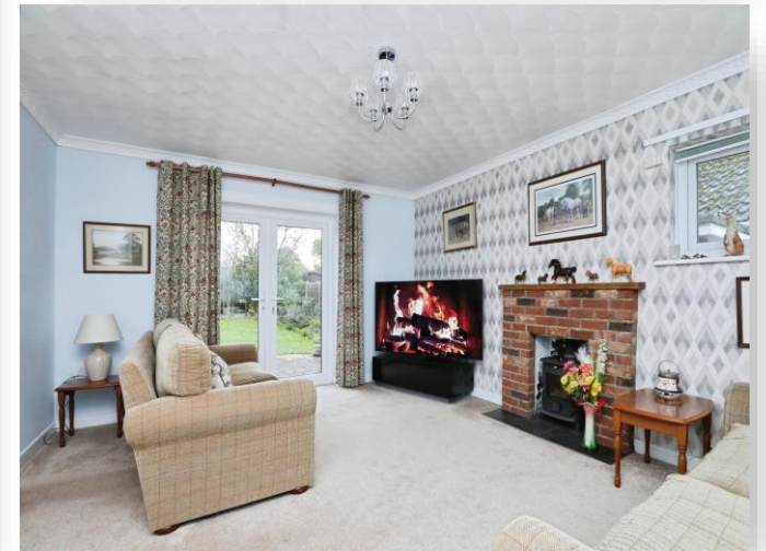
Brackenwoods, Necton, Swaffham, PE37 8EU