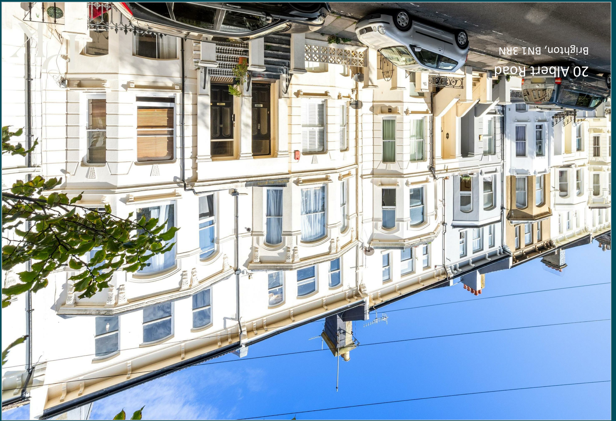
20 Albert Road Brighton, BN1 3RN