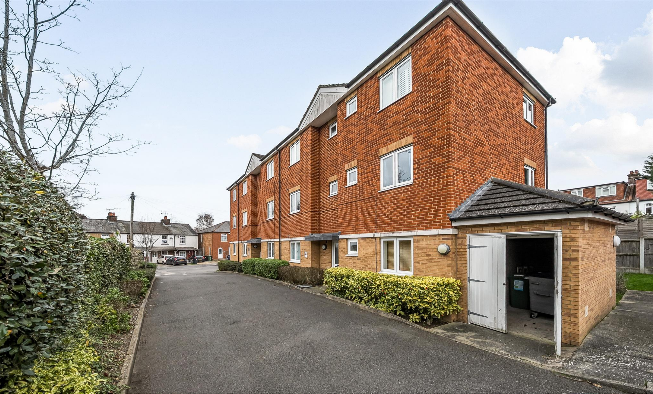
Sanders Place, St. Albans, AL1 5FY