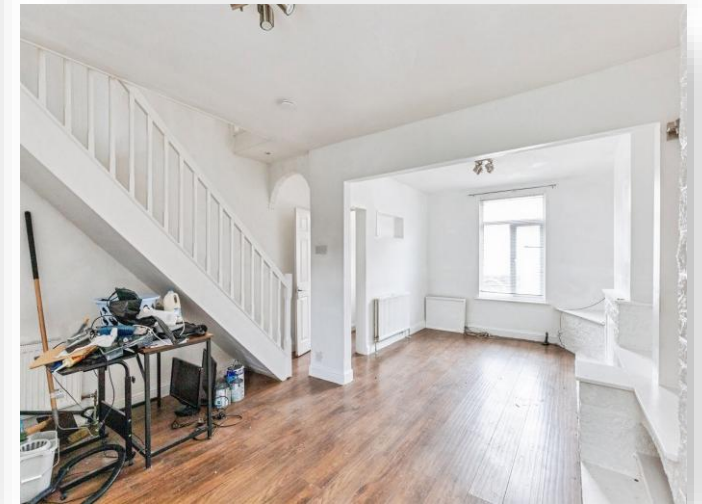
Bedale Road, Wellingborough NN8 4ER