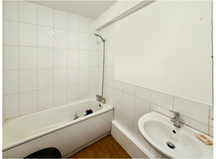
bathroom with shower over bath, basin with pedestal and w.c.