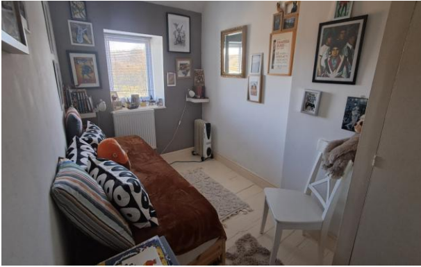
Bedroom 2: With radiator, fitted cupboard and uPVC window facing to the rear looking out across the valley.

Bathroom: A long narrow room with fitted with a modern white suite comprising a bath with shower and screen over, contemporary hand basin and low flush WC. An uPVC window faces to the rear and there is a pair of heated towel radiators.