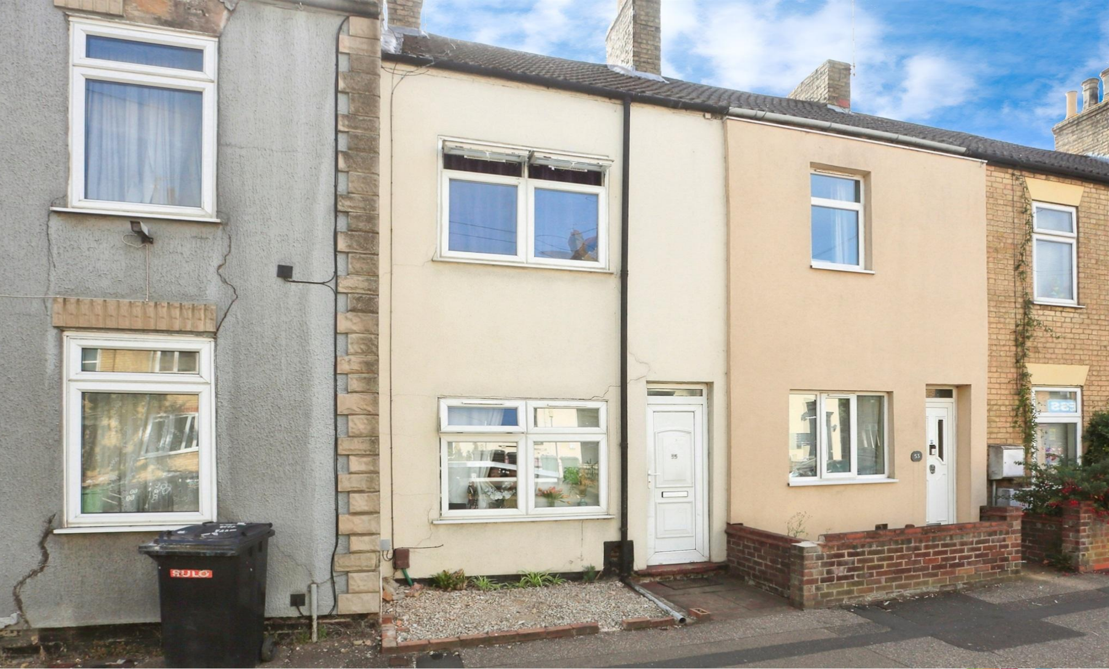
Eastfield Road, Peterborough PE1 4AS