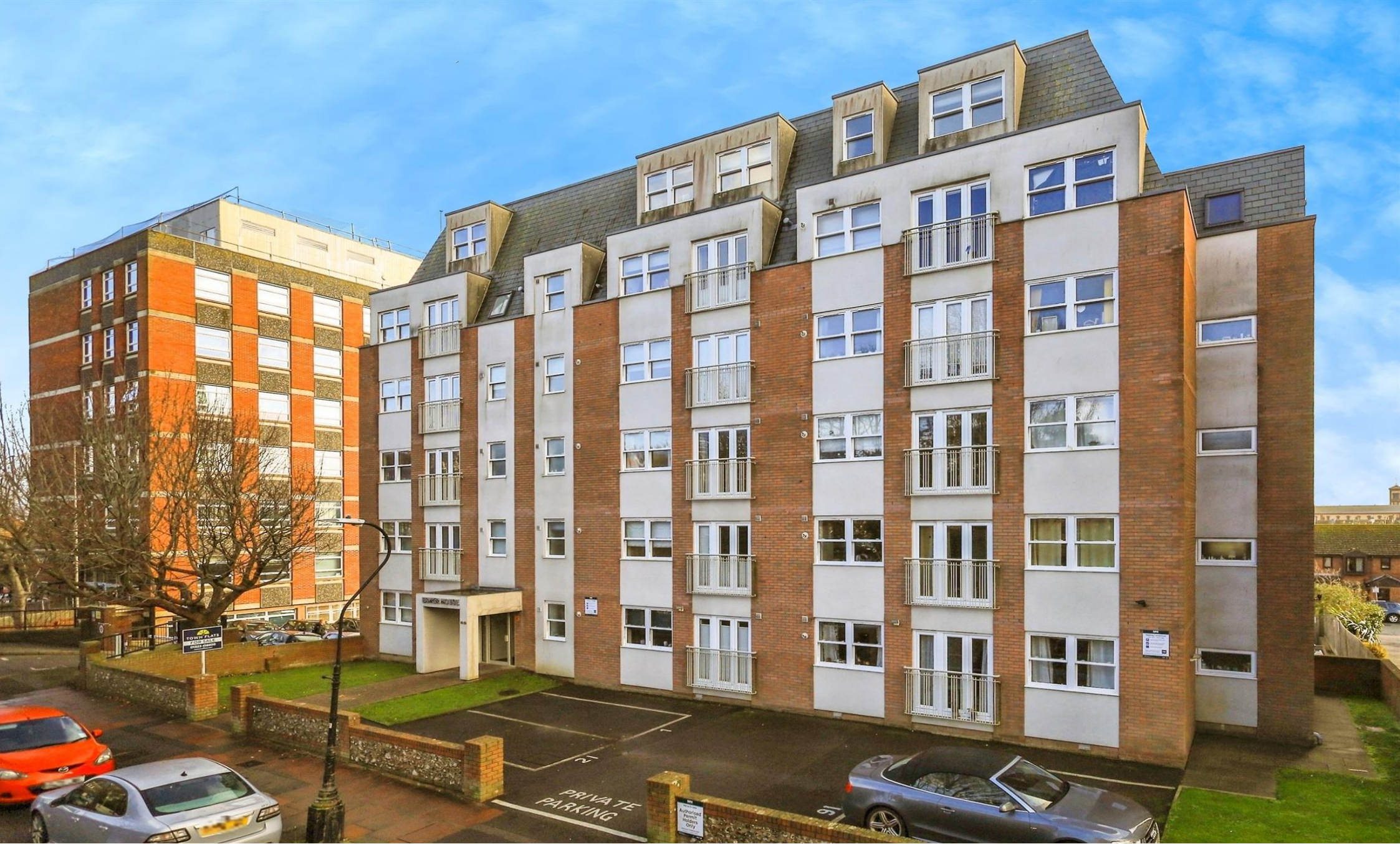
Esher House St. Leonards Road, Eastbourne BN21 3DU