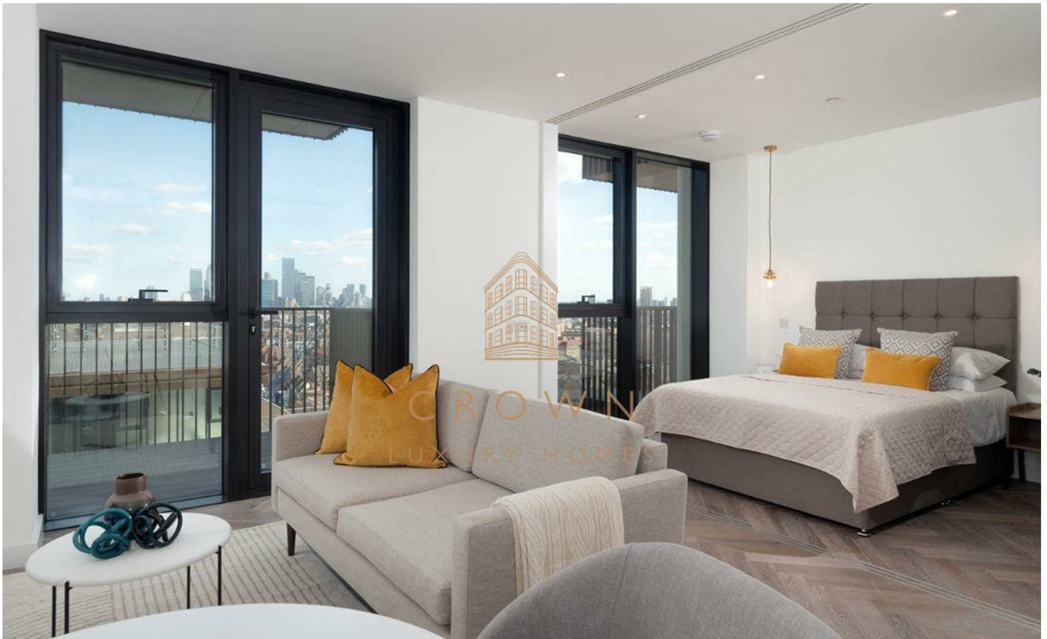
Flat 1603 Cashmere Wharf, 23 Gauging Square, London, E1W 2AX £3,150 Per month