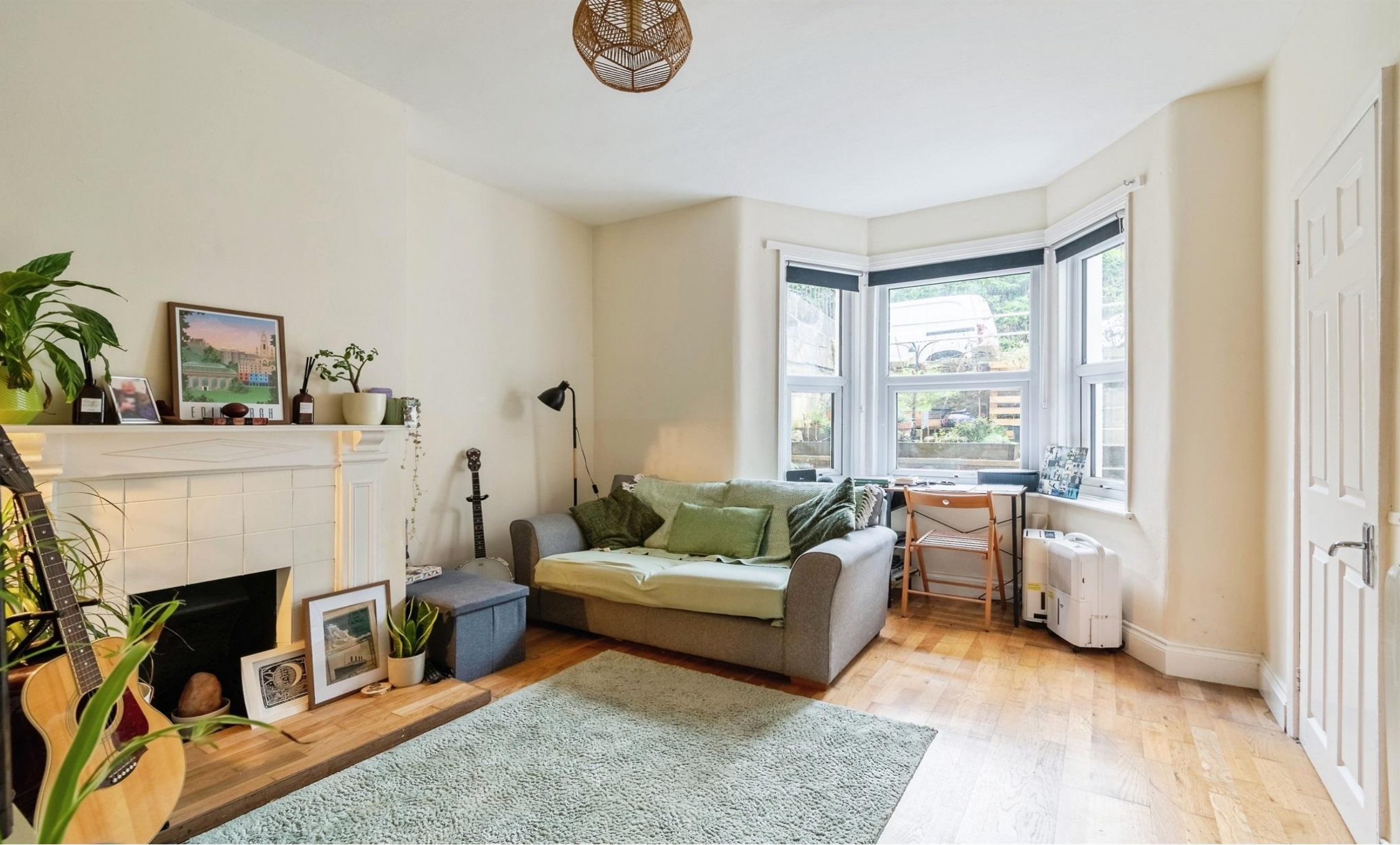
Flat 1 Lower Oldfield Park, Bath BA2 3HP