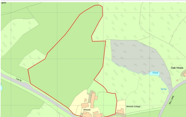
Ordnance Survey Ref: 01161877