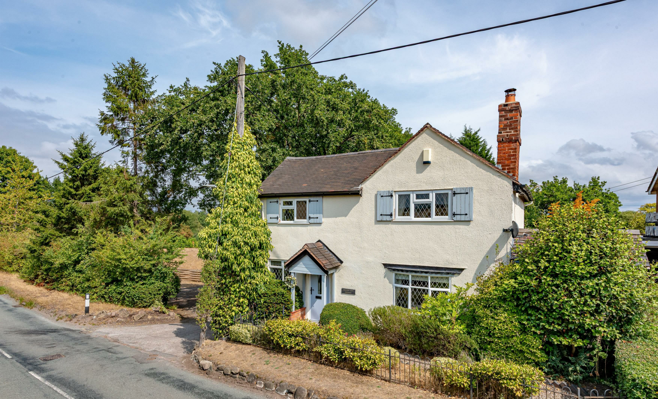
Smestow Gate Cottage, Smestow Lane Smestow, Swindon, Dudley, DY3 4PJ