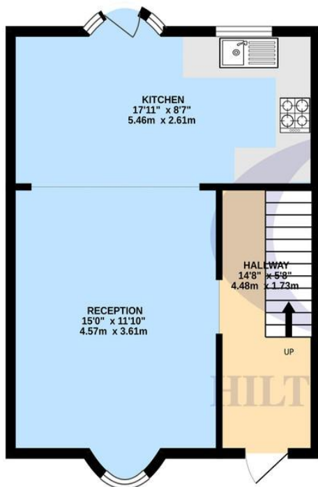
GROUND FLOOR 426 sq.ft. (39.5 sq.m.) approx.