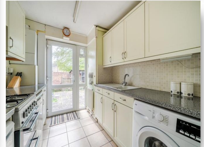
8 Audley Drive, Maidenhead SL6 4QP