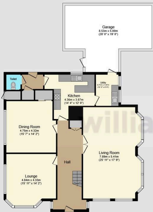
Ground Floor Floor area 157.9 sq.m. (1,700 sq.ft.)