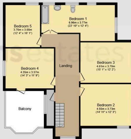
First Floor Floor area 105.7 sq.m. (1,137 sq.ft.)