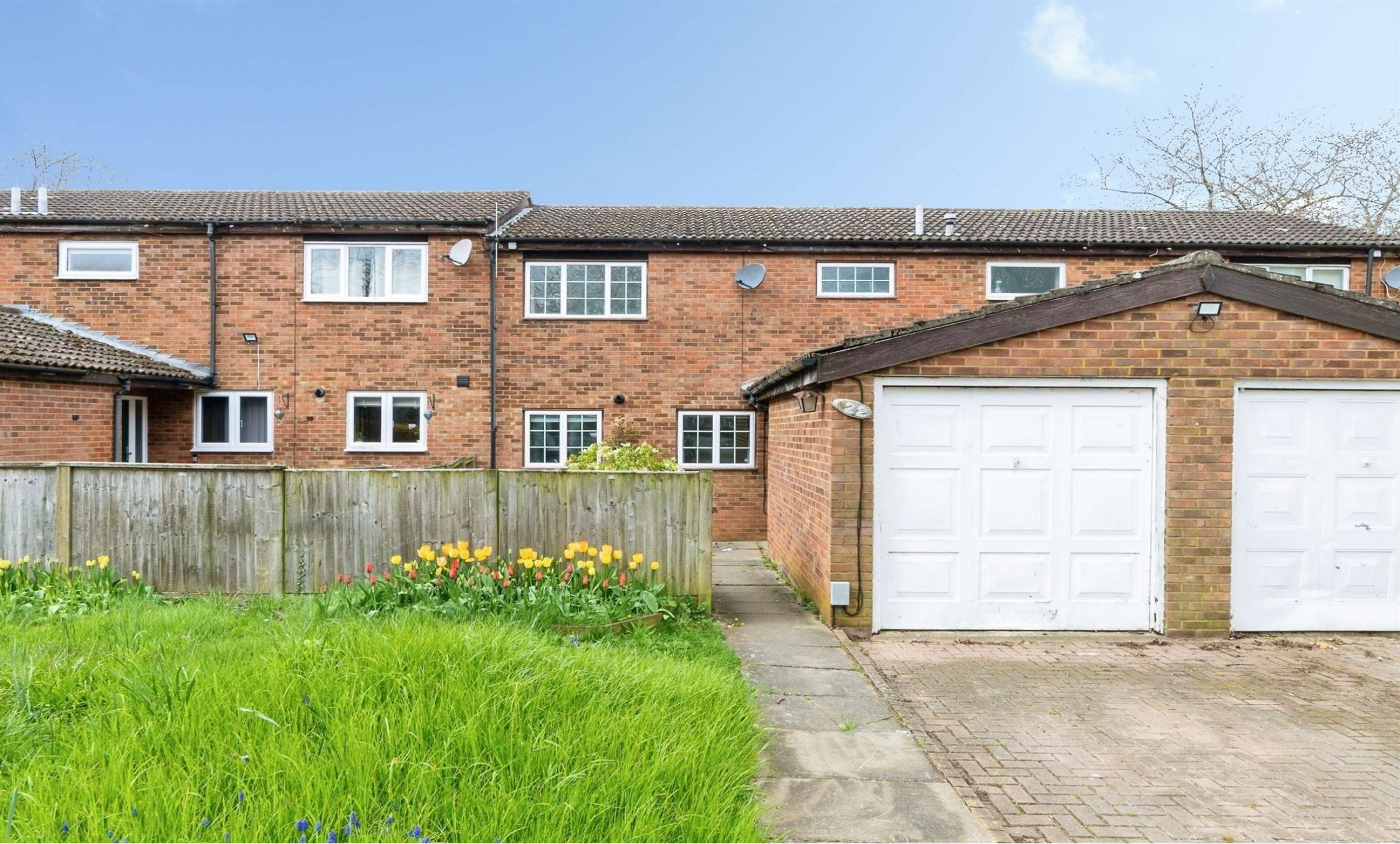
Caernarvon Close, Stevenage SG2 8UB