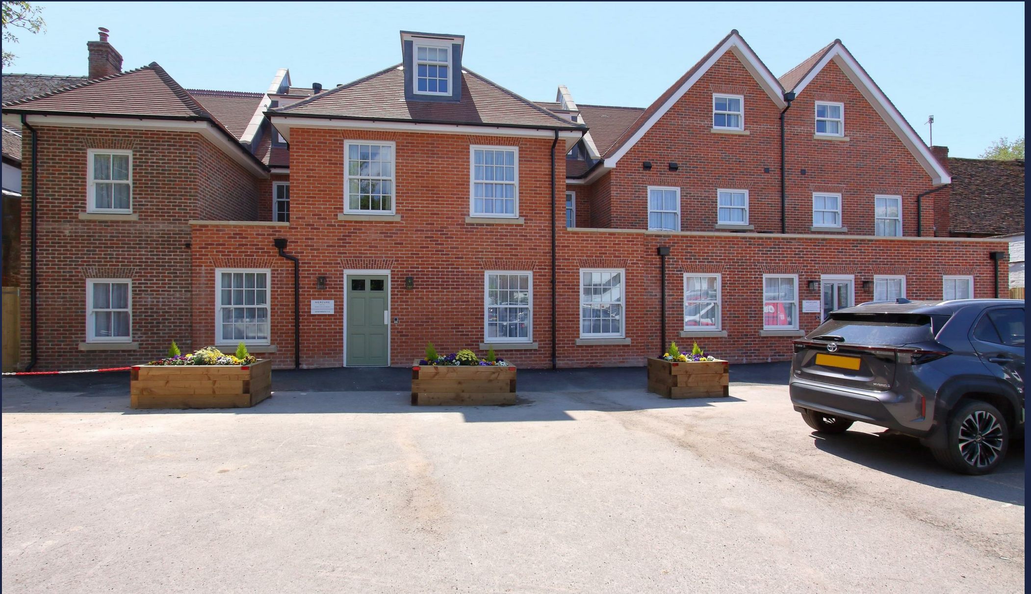
Standard Apartment, Mercure Salisbury, Salisbury