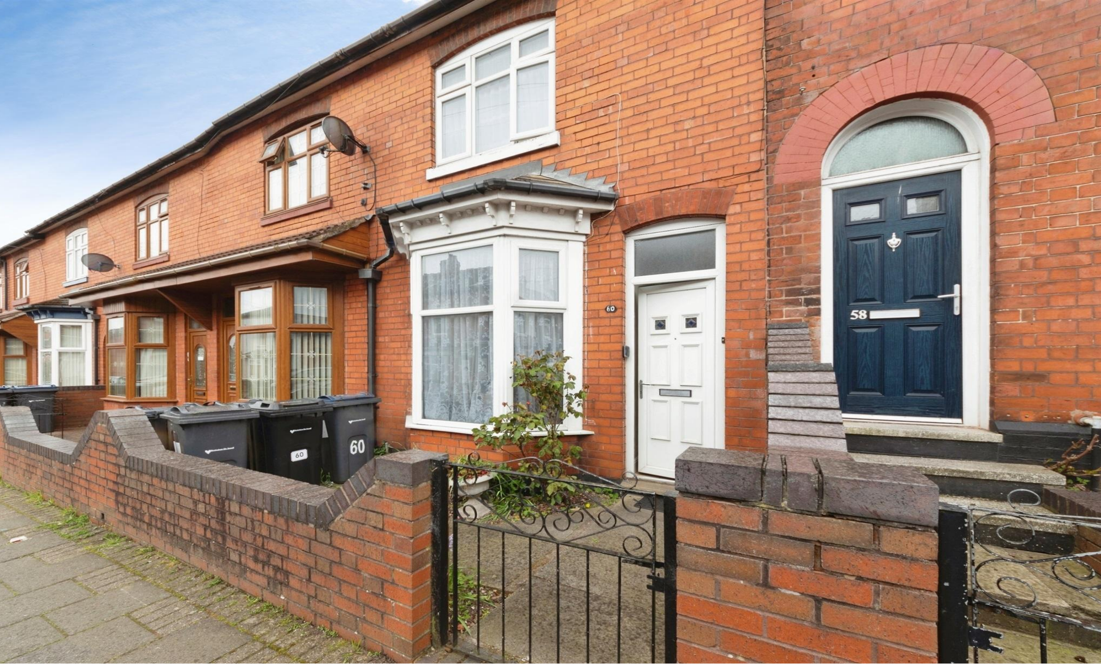
Dolphin Road, Birmingham B11 3LR

Not for marketing purposes INTERNAL USE ONLY