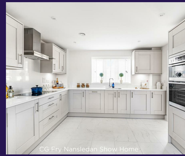
CG Fry Nansledan Show Home