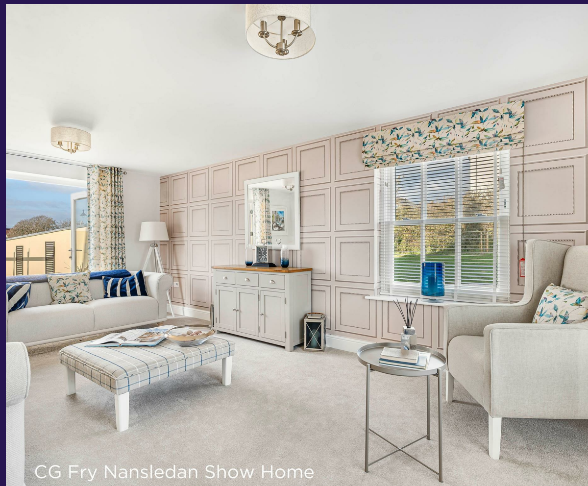
CG Fry Nansledan Show Home

Find out more about our available homes and contact us today to book a viewing.