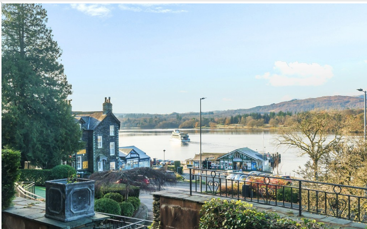
View of Lake Windermere

Having its own private entrance, high ceilings and a fabulous bay window in the large living room showcasing the breath-taking views of Lake Windermere and the surrounding fells, this apartment really is one not to miss! 1 Romney Grange welcomes you via its own private entrance complete with intercom. The entrance hall with a useful, storage cupboard leads to the delightful, spacious open plan living area boasting views of Lake Windermere, the Langdales and Loughrigg Fell.