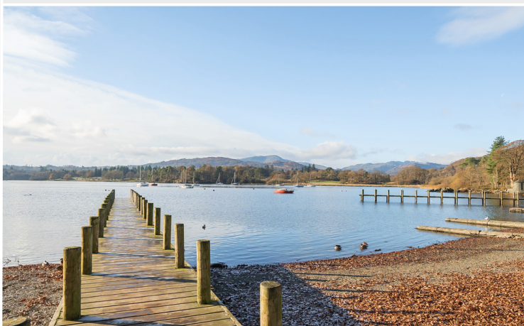
View of Lake Windermere