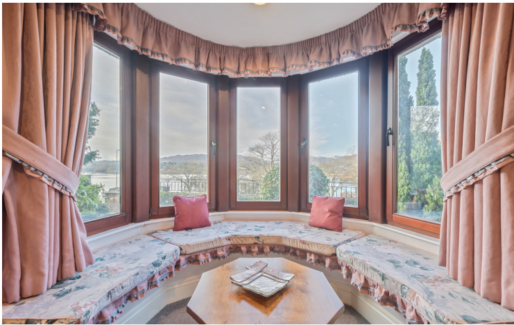
Living Room View