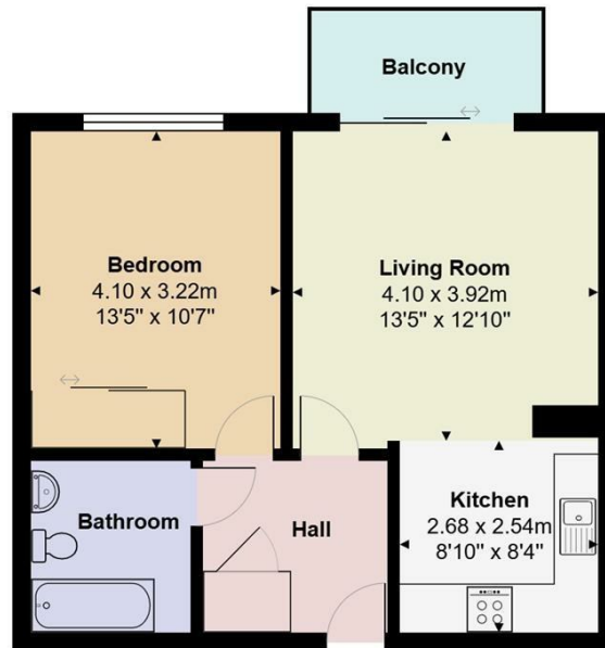
Total Area: 51.0 m 2 ... 549 ft 2 All measurements are approximate and for display purposes only