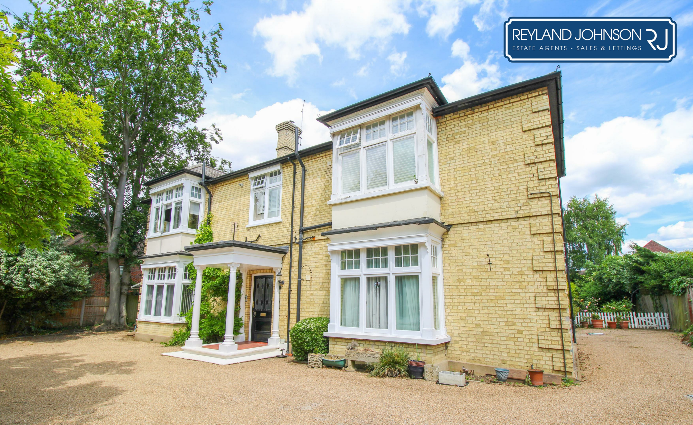
Hillsborough House, Old Harlow, CM17 0JS £260,000