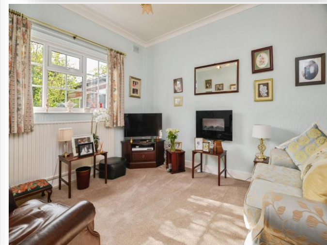
Grange Close, Hartlepool, TS26 0DU