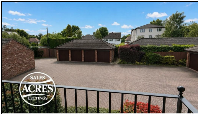
Tudor Park Court, Farncote Drive