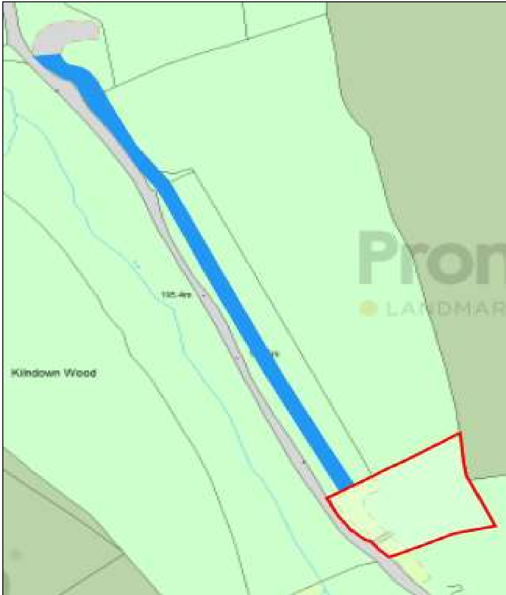
Sales Plan: (for identification purposes only – not to scale.)