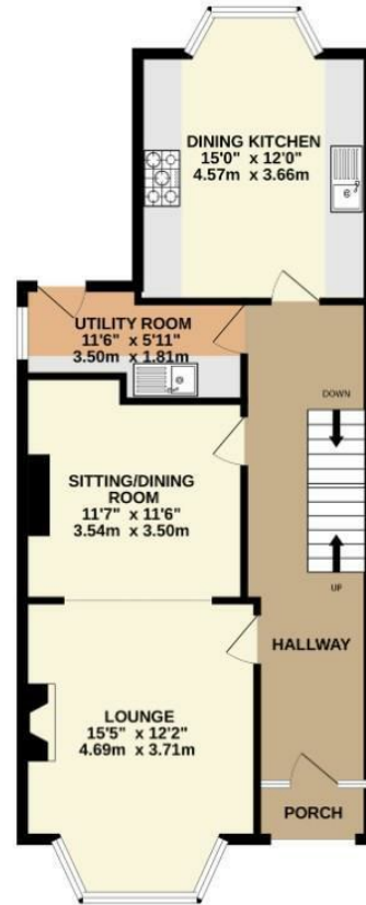
GROUND FLOOR 694 sq.ft. (64.5 sq.m.) approx.