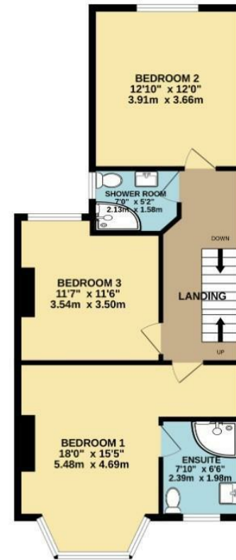
1ST FLOOR 654 sq.ft. (60.8 sq.m.) approx.