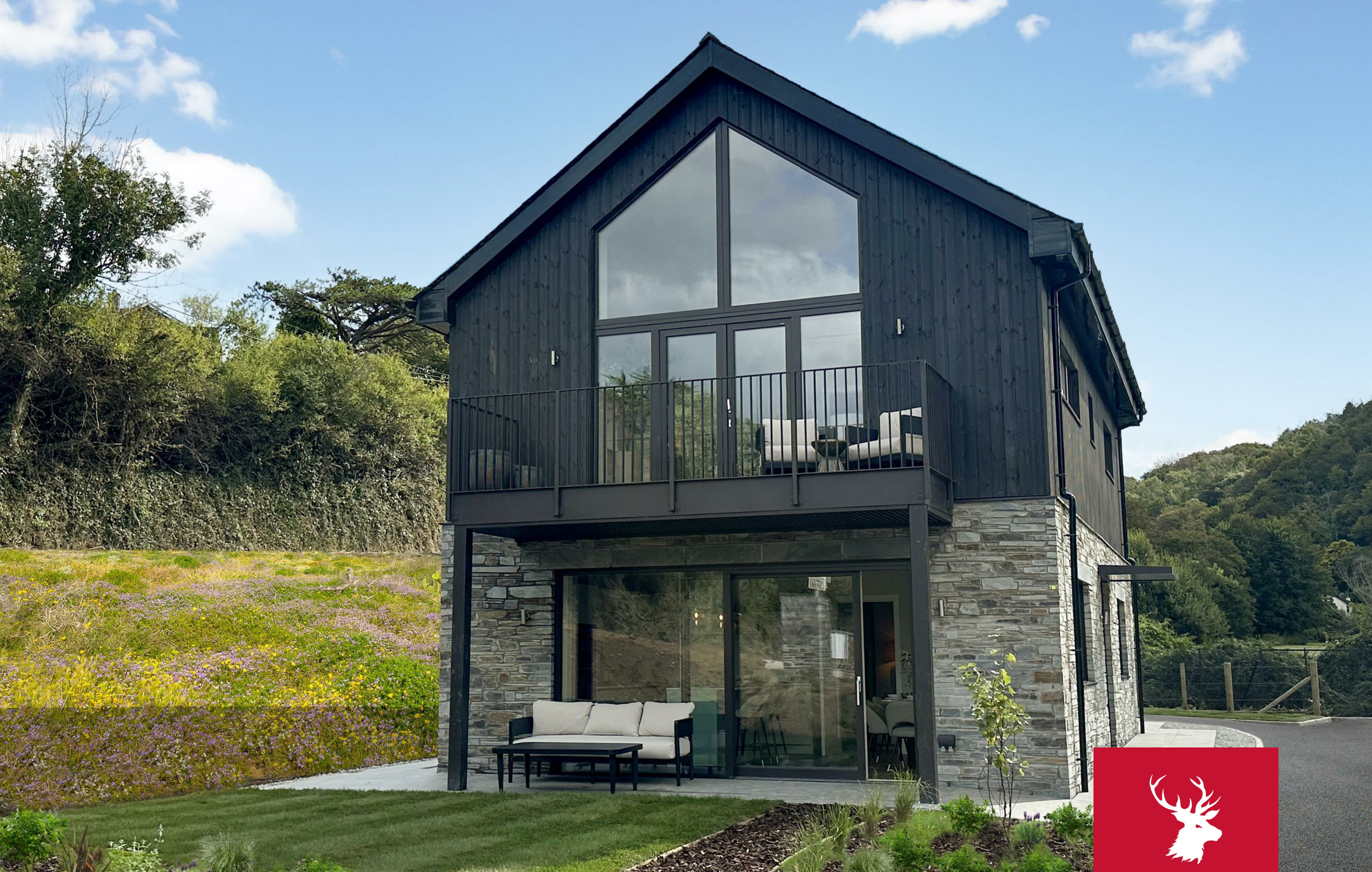
House 4, Lee Bay Gardens