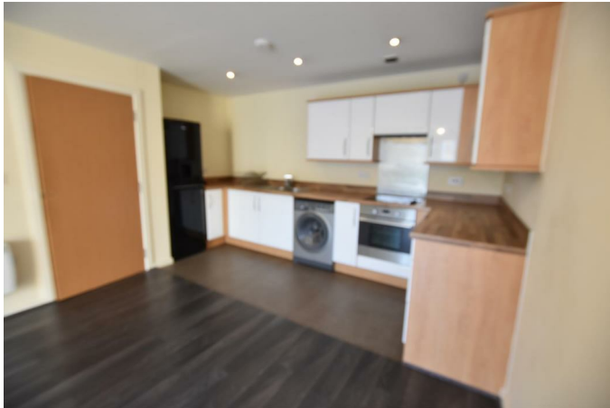
Kitchen 13'5" x 5'1" (4.09 x 1.55)

Wall and floor units, integrated oven with electric hob, one and a half stainless steel sink, plumbed automatic washer.