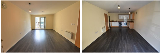
Lounge/Kitchen 16'0" x 11'5" (4.90 x 3.48)

Wood floor, Upvc double glazed sliding doors providing access to balcony, electric heater.