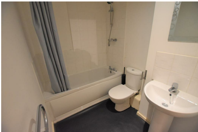
Bathroom 6'11" x 5'6" (2.13 x 1.68)

Panel bath with shower above, WC, pedestal hand wash basin, chrome heated towel rail, part tiled walls, inset spotlights.