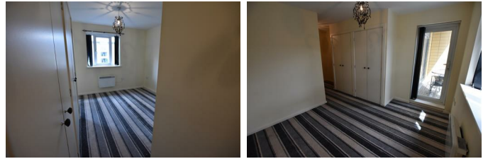
Bedroom 10'7" x 9'4" (3.25 x 2.87)

Upvc double glazed window, Upvc double glazed door giving access to balcony, electric heater, storage compartment.