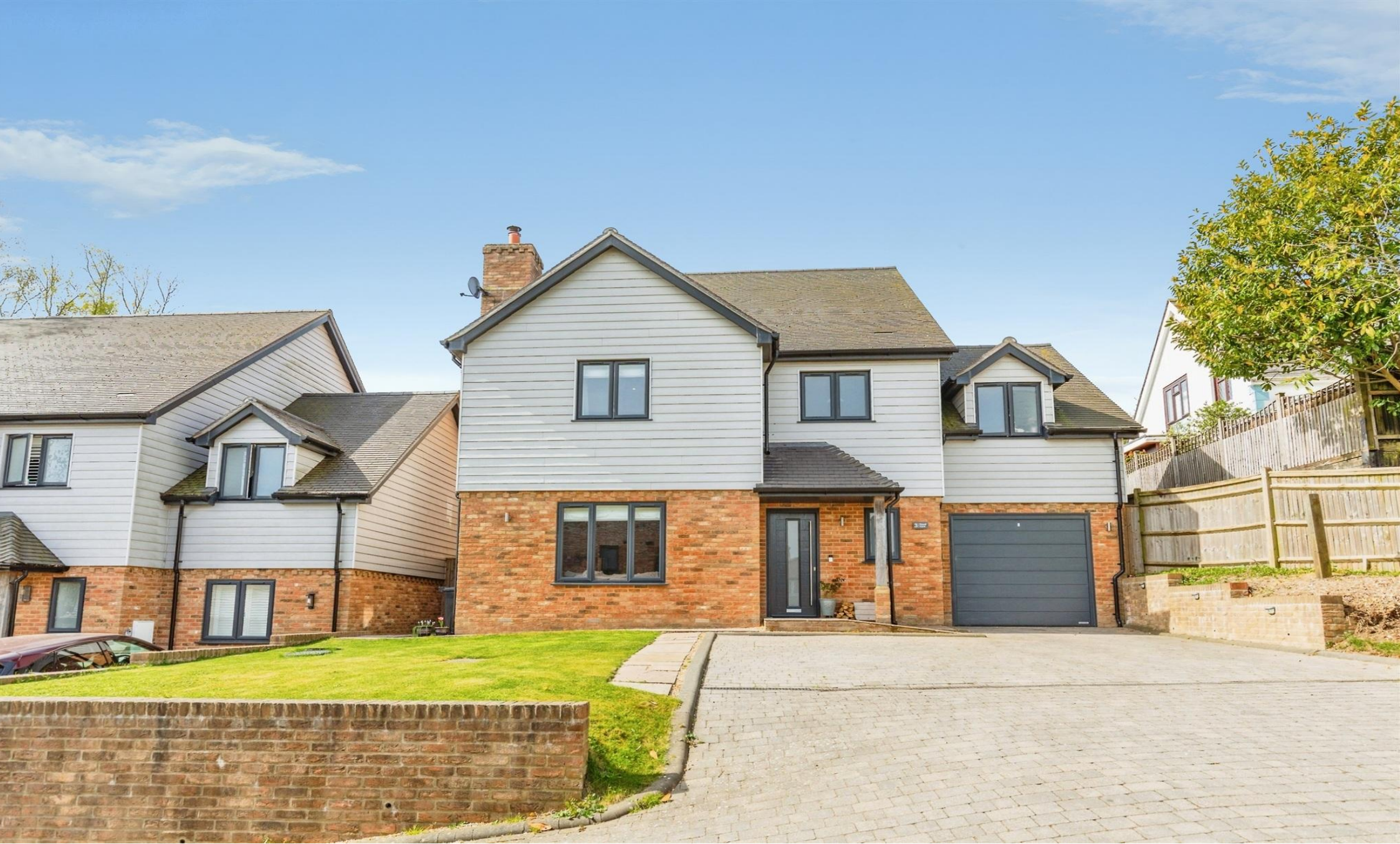
Wood View, St. Leonards-On-Sea TN37 7FL