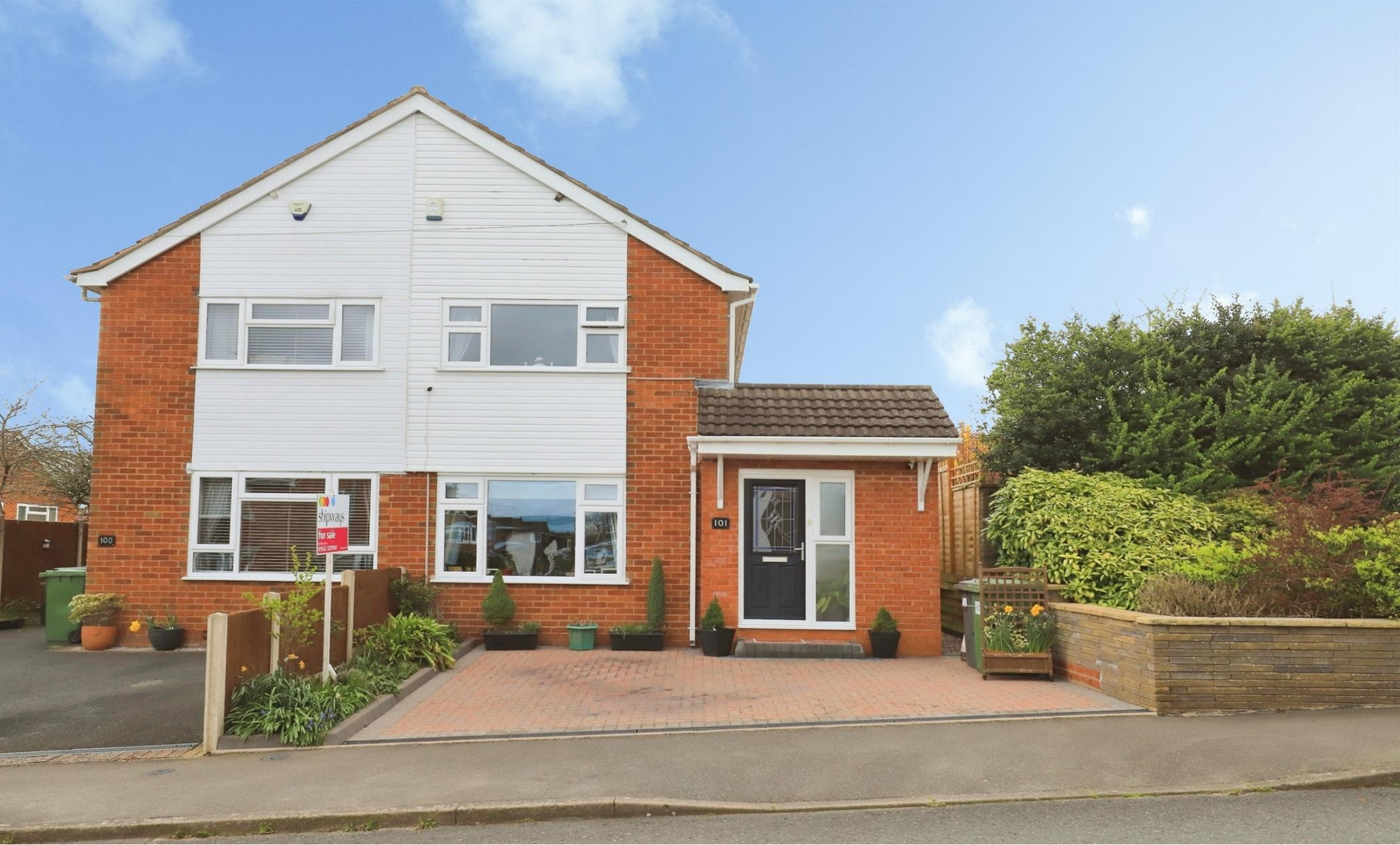
Crestwood Avenue, Kidderminster DY11 6JS

Not for marketing purposes INTERNAL USE ONLY