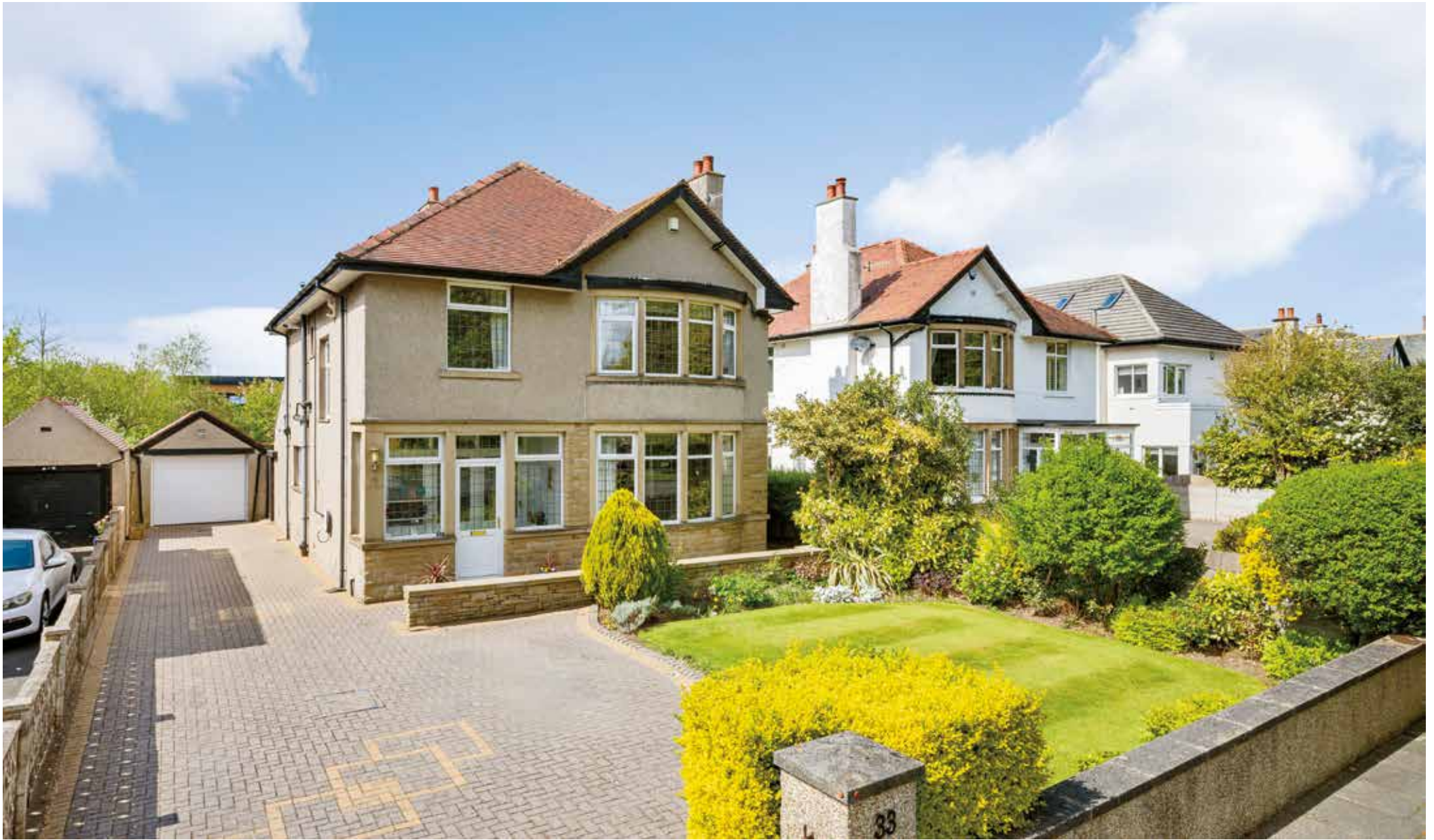
33 Broadway Morecambe | Lancashire | LA4 5BQ