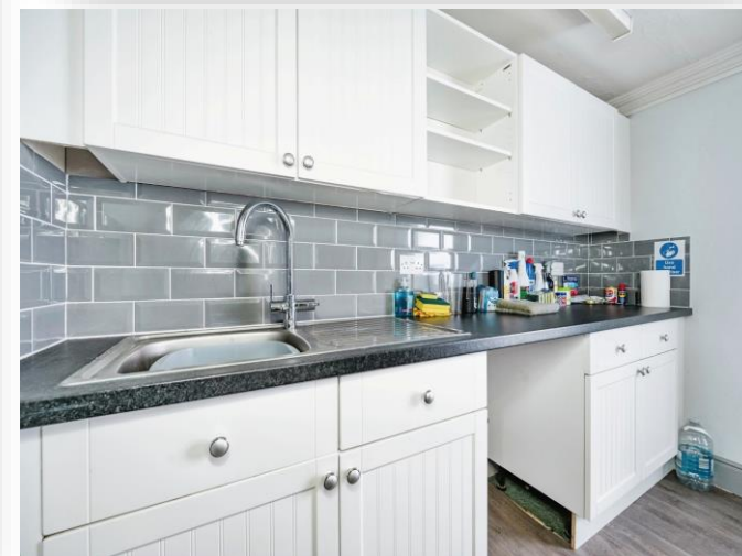
Old Market, Wisbech, PE13 1NB