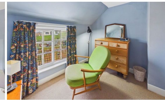
GLENCOE, ROBIN HOODS BAY- 4 bed Detached House -£475,000