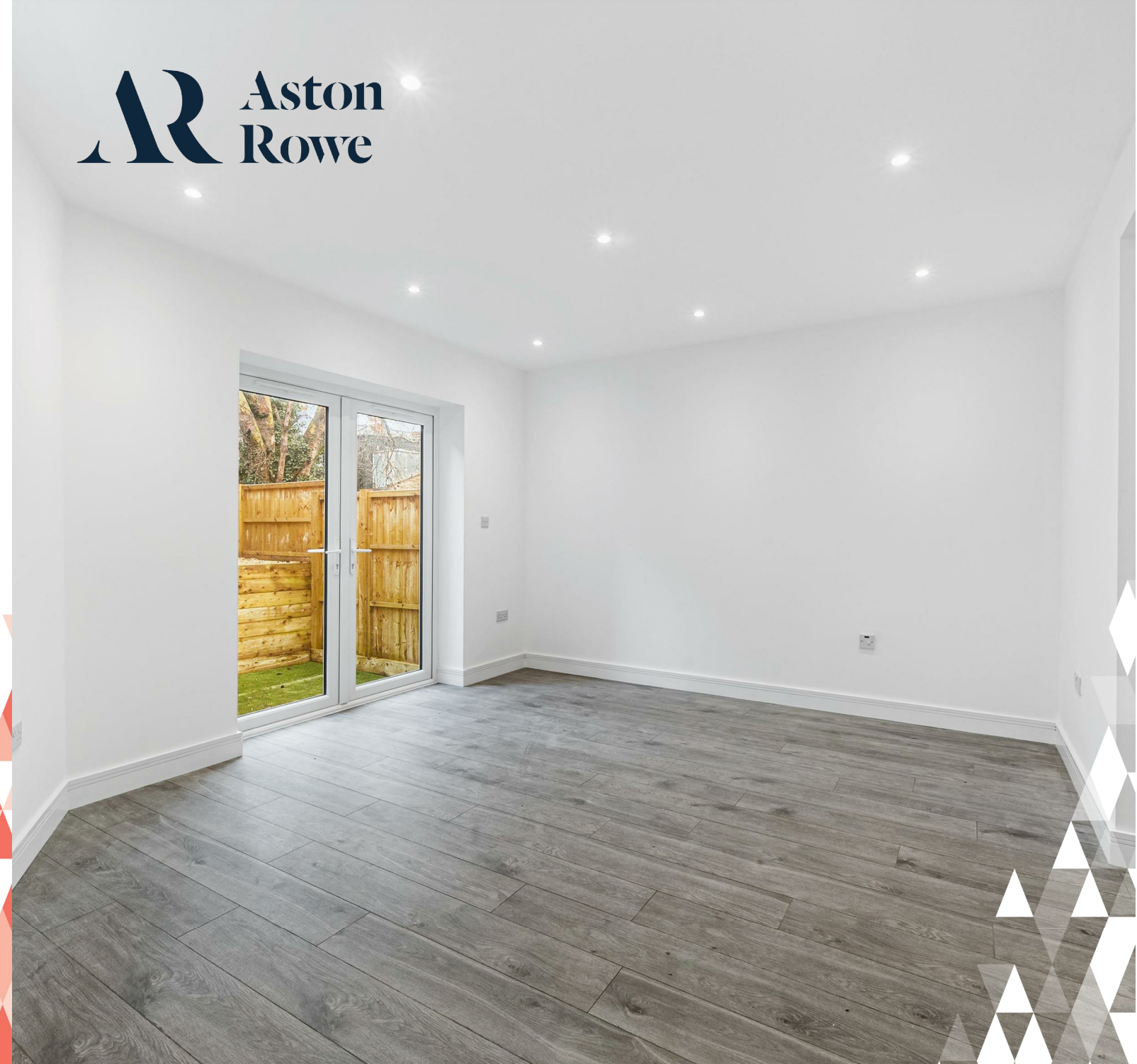
Berrymead Gardens Approximate Gross Internal Area = 45.6 sq m / 490 sq ft