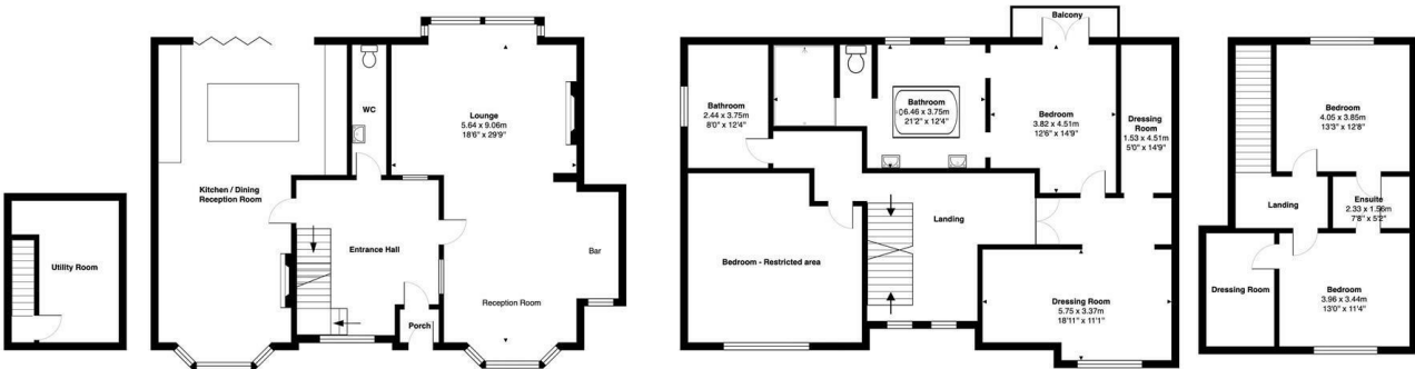
68, Cambridge Road, Southport, PR9 9RH Total Area: 322.1 m 2 ... 3467 ft 2 (excluding balcony) All measurements are approximate and for display purposes only