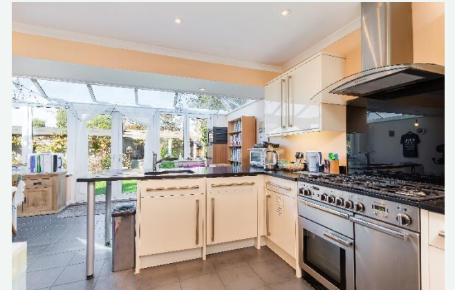
3 Downs View Road, Bembridge, Isle of Wight