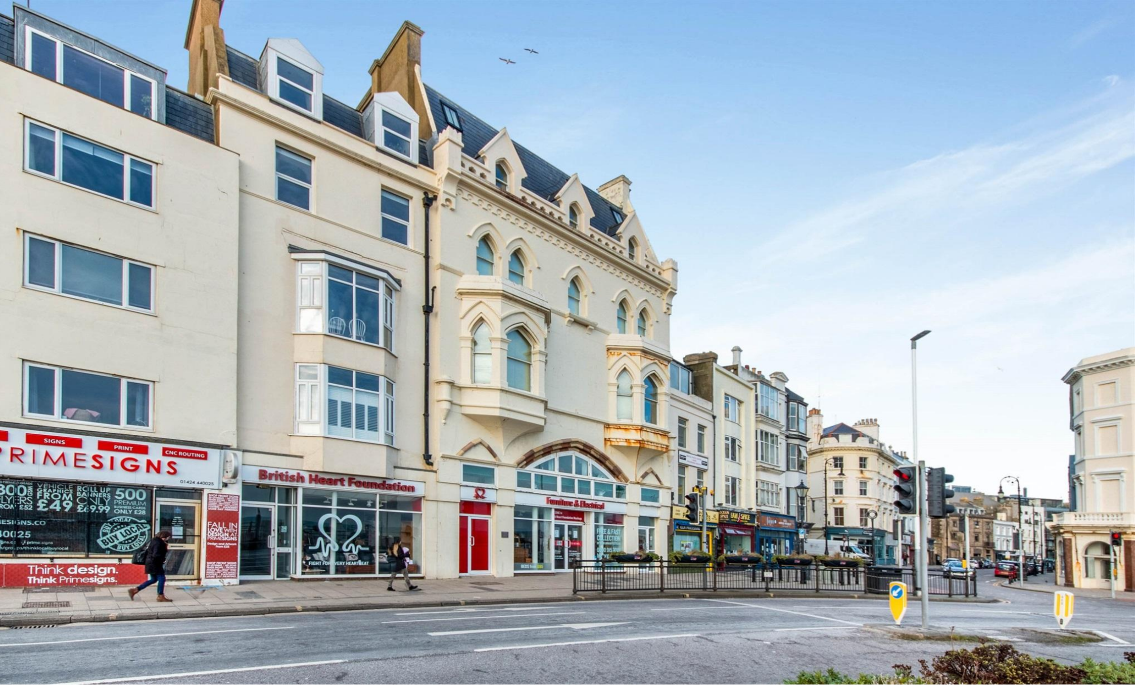
White Rock Court White Rock, Hastings TN34 1JL