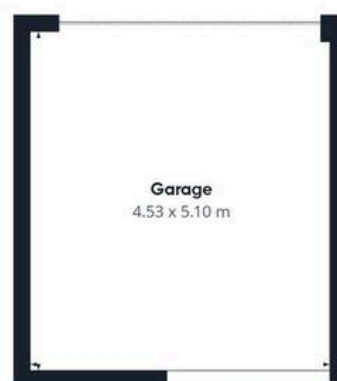
Floor 0 Building 2