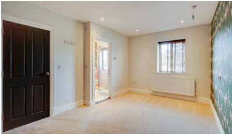
The staircase leads up from the entrance hallway to the generous landing with its dark wood banisters and attractive pendant lighting. On this floor, as downstairs, the very greatest care has been taken to design and execute each room to the very highest standards. The dual aspect principal suite has a large bedroom with a feature wall, a dressing room with fully fitted hanging space and drawers and a sleek, elegant four piece en-suite bathroom with his and hers sinks with quartz tops, a walk in shower, claw footed free-standing bath and heated towel rail. The guest bedroom benefits from an stylish en-suite shower room and there are three more good sized double bedrooms, ideal for any family configuration. The contemporary family bathroom has a bath and walk in shower.