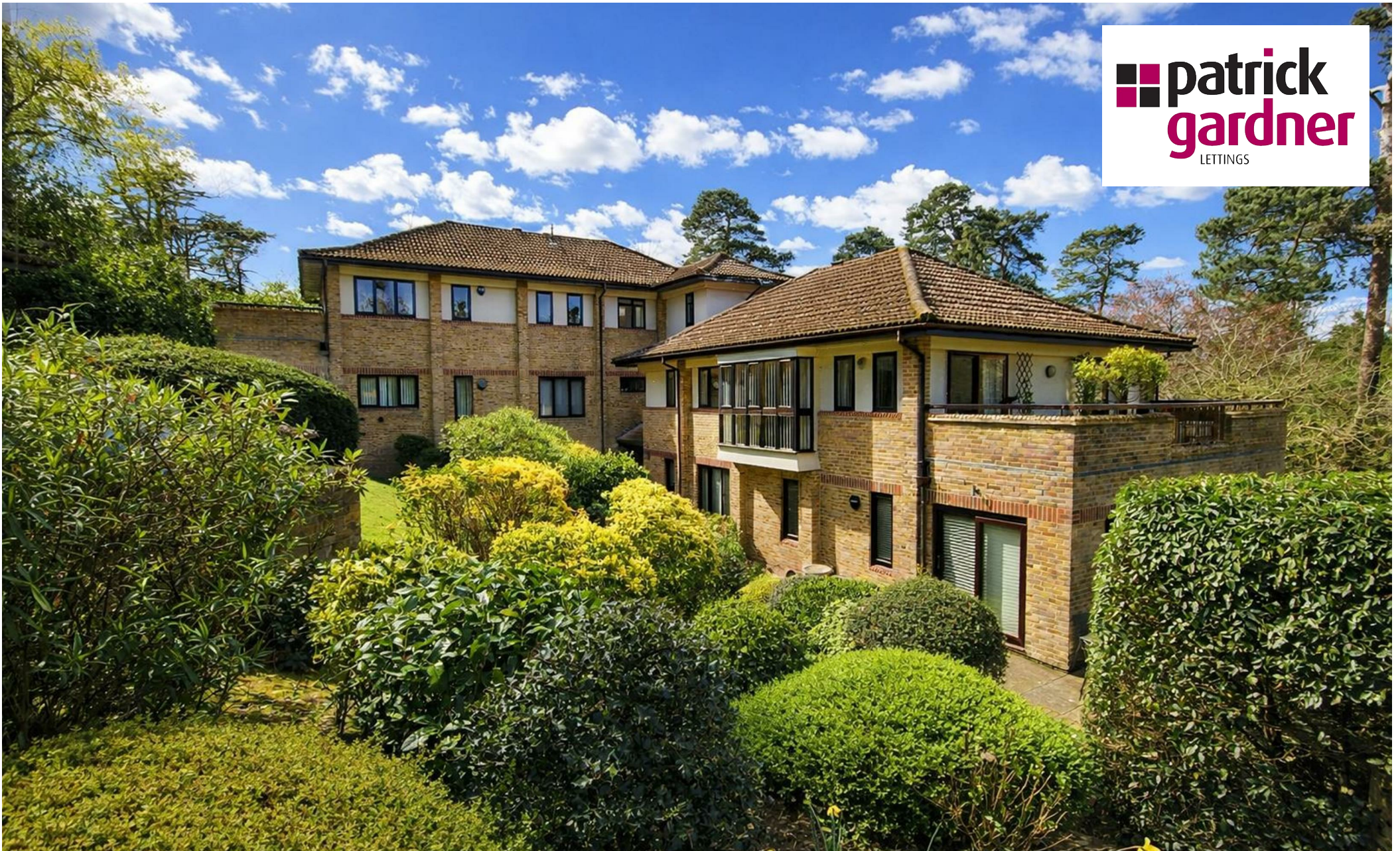
Willow Court, The Gables, Oxshott, KT22 0SD