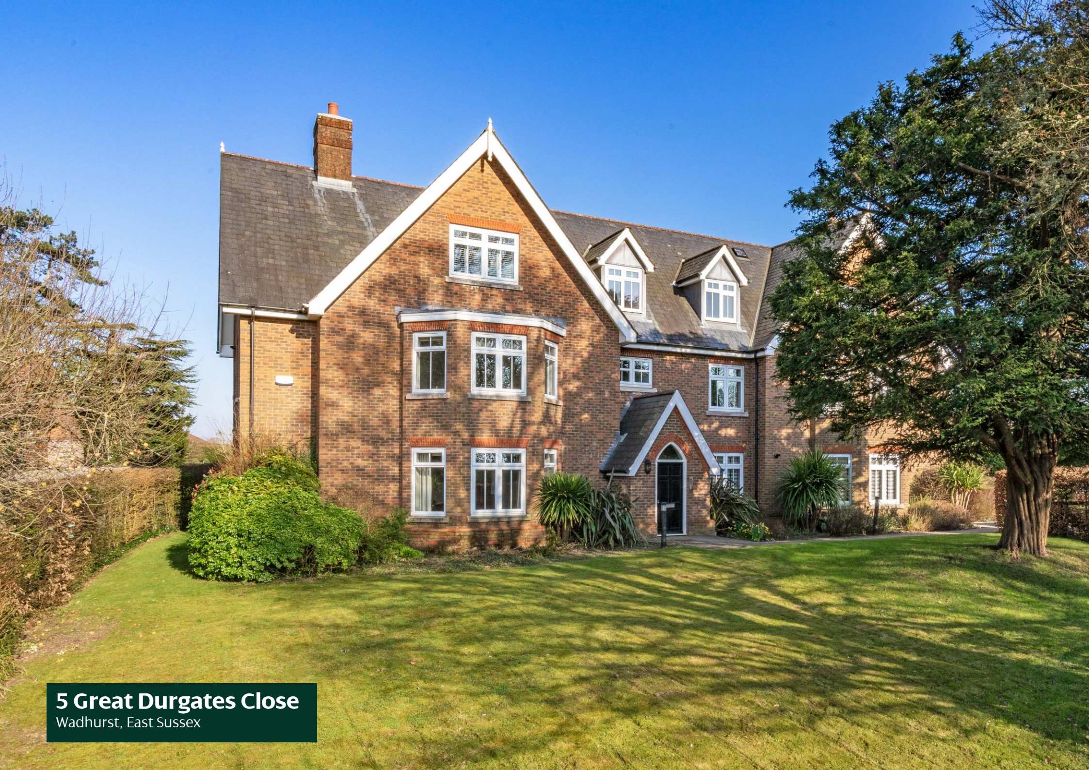
5 Great Durgates Close Wadhurst, East Sussex