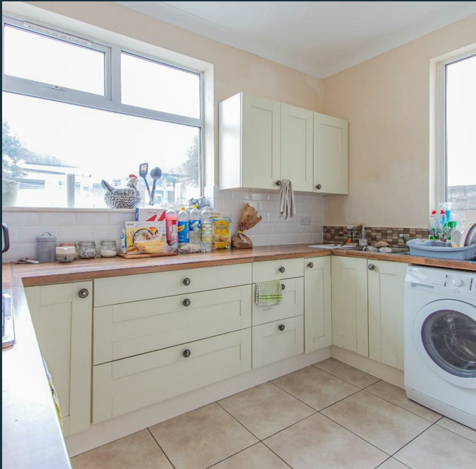
Whitchurch Road, Heath