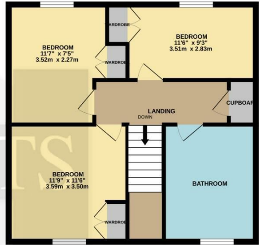
1ST FLOOR 565 sq.ft. (52.5 sq.m.) approx.