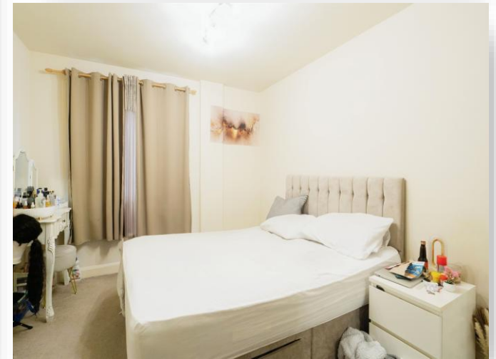
The Annexe Junior Street, LEICESTER LE1 4QF